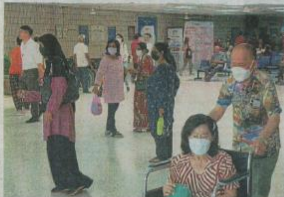
Stay safe and alert: People wearing face masks to protect themselves in George Town.

"Although the number of cases per influenza outbreak has shown a significant decline with no serious cases detected in any of the outbreaks, the public still needs to be vigilant about their health and seek immediate treatment if they feel unwell," he said.